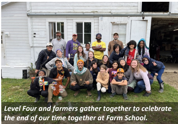
Level Four and farmers gather together to celebrate the end of our time together at Farm School.

Among our literary pursuits have been our first book club book, The Hundred Dresses , and fairy tales. We've had engaging discussions comparing and contrasting adaptations, looking at recurring elements, and listing the just desserts for villains, as well as practicing skills like summarizing. This is setting us up for deeper understandings of folktale structures and storytelling. We're playing outside while the weather is still amiable and took a jaunt in the Arboretum, looking at leaf shapes and exploring hidden paths (with cool frog pools). Our learning has ranged from place value to human rights to KenKens to etymology and emotions.