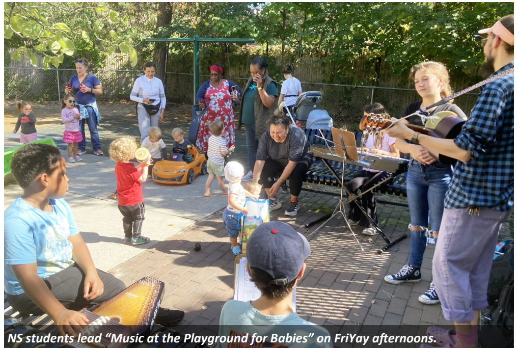
NS students lead "Music at the Playground for Babies" on FriYay afternoons.