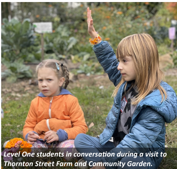
Level One students in conversation during a visit to Thornton Street Farm and Community Garden.