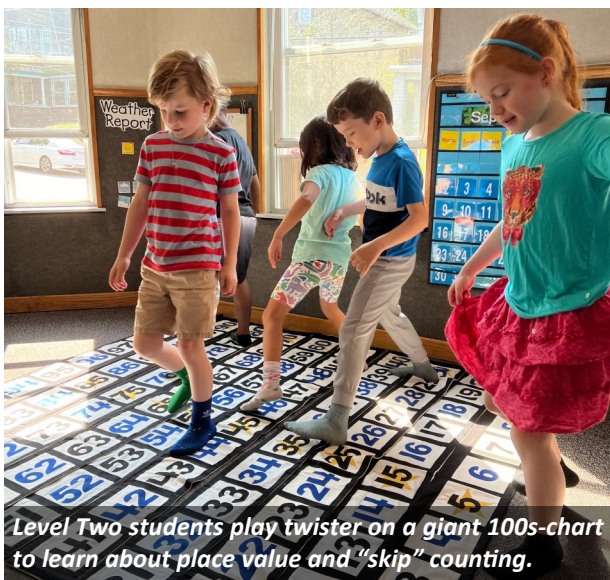
Level Two students play twister on a giant 100s-chart to learn about place value and “skip” counting.

In Level One, we've created a structure for class meetings that lets students share their ideas and experiences and present activities they are working on or have finished. During these meetings, children learn to join group discussions, take on different perspectives, and present their thoughts while receiving feedback. These sessions ensure students feel valued and encouraged as they express their viewpoints and efforts. We challenge them to be thoughtful in their decisions and reflect on their process. For example, if a student has been playing in the dramatic play area, they have the chance to explain their story and the focus of their play, or if they've painted a picture, they can discuss the colors they chose and why. When the class needs to decide how to care for classroom materials, we brainstorm solutions together. These meetings allow children to express their intentions, plan, regulate collectively, and unite as a classroom community. They learn to share responsibility with both their teacher and peers.