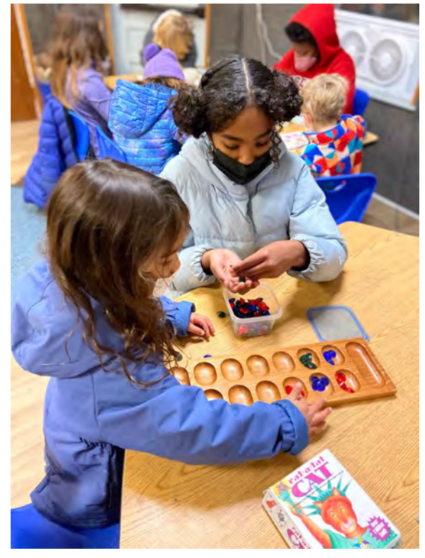
A Level Four student teaching a Level One friend the game of Mancala.

This winter season, the children can look forward to an introduction to new winter-themed activities, ice projects, craft club, and fun in the snow! It is important to create an environment where students can pursue their interests, have meaningful engagement, and grow in everyday skills. The goal of Afterschool is to provide the students with a joyful experience in a multitude of ways. This program is something I craft with passion and intention. I enjoy the kids bringing their smiles and individuality to the activities that I plan. I welcome their squeals of excitement accompanied by running feet when I announce that, "Inside is open!" The relaxed time together allows for me to get to know the students and for them to bond with one another. It is a fulfilling and heartfelt time, full of laughs and all the things kids say! Afterschool at Neighborhood School has a bit of magic to it, and that's how we like it!