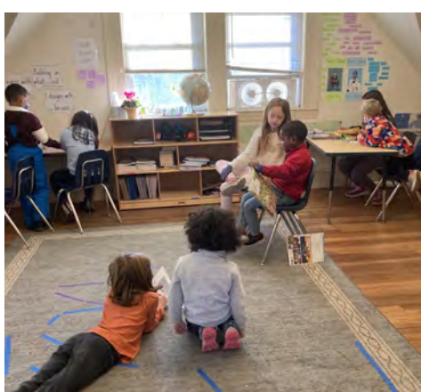
Image: Level Two starts their light unit, exploring the ways that light may be used.

This winter, Level Two is launching two new units of study! With our lab coats and safety goggles firmly in place, our young scientists will explore light waves and how different materials interact with light. In social studies we are beginning a biography unit. We will learn about many different kinds of people – activists, scientists, inventors, performers, athletes...you name it! What inspired these folks? How did they make their mark? What can we learn from them? Join us at the Learning Fair once winter's cold has dissipated to see the fruits of this learning!