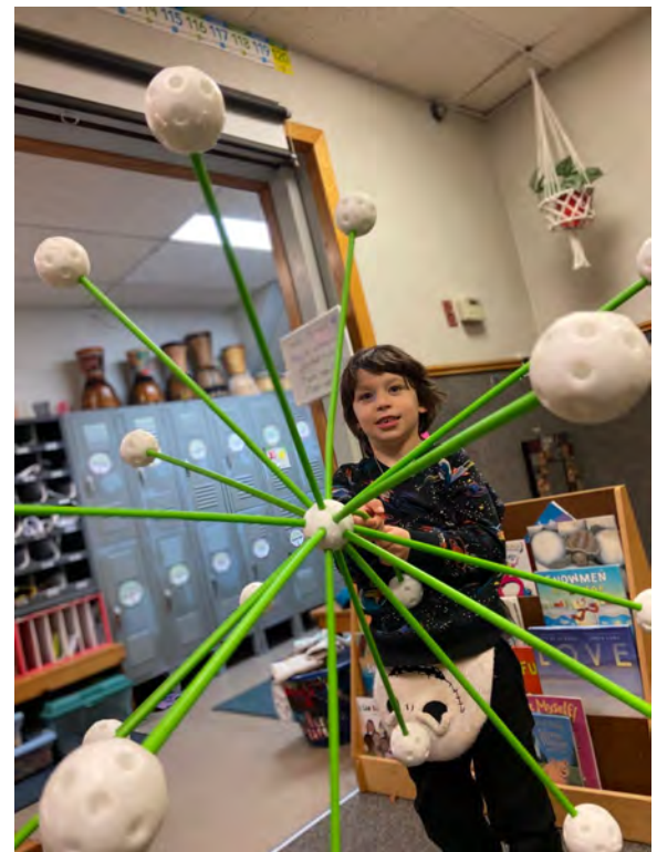
A Level Two student exploring possibilities through 3-D structure building.