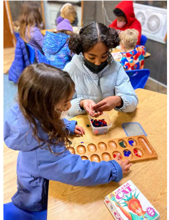
A Level Four student teaching a Level One friend the game of Mancala.

This winter season, the children can look forward to an introduction to new winter-themed activities, ice projects, craft club, and fun in the snow! It is important to create an environment where students can pursue their interests, have meaningful engagement, and grow in everyday skills. The goal of Afterschool is to provide the students with a joyful experience in a multitude of ways. This program is something I craft with passion and intention. I enjoy the kids bringing their smiles and individuality to the activities that I plan. I welcome their squeals of excitement accompanied by running feet when I announce that, "Inside is open!" The relaxed time together allows for me to get to know the students and for them to bond with one another. It is a fulfilling and heartfelt time, full of laughs and all the things kids say! Afterschool at Neighborhood School has a bit of magic to it, and that's how we like it!