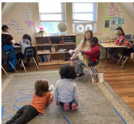
Image: Level Two starts their light unit, exploring the ways that light may be used.

This winter, Level Two is launching two new units of study! With our lab coats and safety goggles firmly in place, our young scientists will explore light waves and how different materials interact with light. In social studies we are beginning a biography unit. We will learn about many different kinds of people – activists, scientists, inventors, performers, athletes...you name it! What inspired these folks? How did they make their mark? What can we learn from them? Join us at the Learning Fair once winter’s cold has dissipated to see the fruits of this learning!